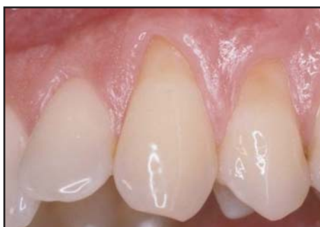
Figure 8. Class I recession on the left canine and the first bicuspid.

influence soft tissue healing by migration of periodontal ligament cells and gingival fibroblasts to the root surface 8 by gingival fibroblast stimulation. 9