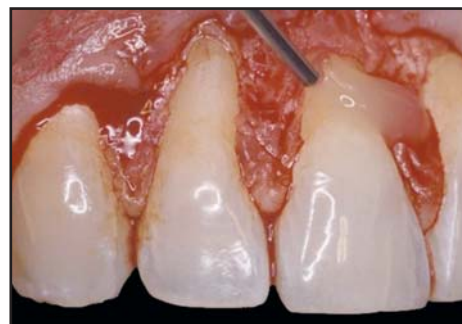
Figure 4. Application of Emdogain (Straumann, Andover, MA) on the exposed etched and dried roots.