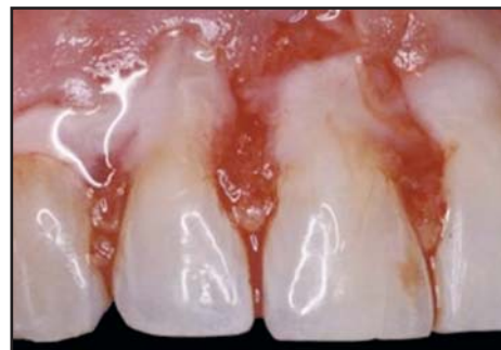
Figure 3. After root planing, the acid gel is applied on the root surfaces.