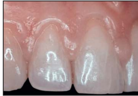
Figure 1. Case 1. Class I recessions on the incisor teeth. The central incisor papilla is compressed due to lingual orthodontic therapy.

Enamel matrix derivative has been shown to promote cementogenesis and bone formation as well as new attachment. 5,6 It has been shown that EMD possesses the potential to stimulate the formation of new connective tissue, new bone, new periodontal ligament, and cementum. 5,6 Cumulative evidence indicates EMD's ability to increase proliferation, migration, adhesion, and differentiation of cells responsible for tissue healing in vivo. 7 Several studies have shown that EMD may not only enhance periodontal regeneration, but may also