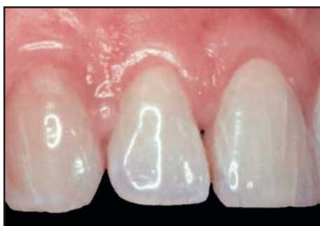
Figure 6. Aesthetic results 6 months following surgery. Note the root coverage keratinized gingiva up to the CEJs and gingival thickness.