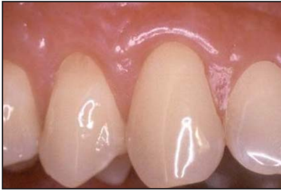
Figure 15. Increased keratinized gingiva can be seen in the right maxillary one year postoperatively.