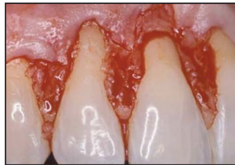
Figure 2. A partial-thickness flap is elevated via gingivoplasty of the papillae peaks.