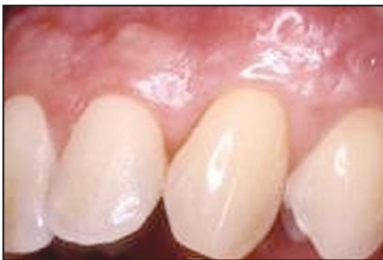
Figure 16. Color harmony, with a probing depth of less than 1 mm, can be seen in the left maxillary after 1 year .

Achieving an optimal aesthetic result is difficult to obtain with implants in the anterior aesthetic zone. The gingiva, particularly if it is narrow in a thin-scalloped biotype, inevitably retracts 6 months after the abutment connection and restoration, due to the reformation of the biologic width. The challenge, then, becomes properly treating recession (ie, bone and gingiva) around an implant.