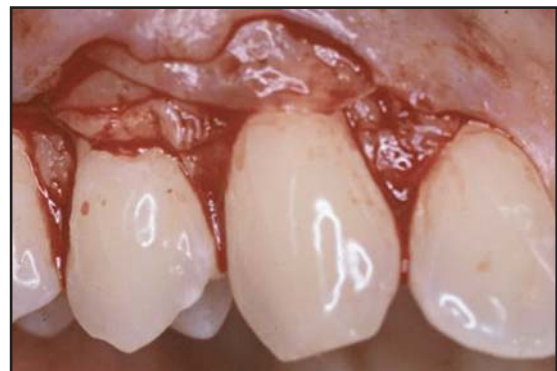
Figure 11. The membranes are placed on the right vascularized recipient bed and over the recession.

The fibrin clot derived from PRP was able to stimulate Type I collagen synthesis. Since the platelet concentrate has a higher number of platelets per millimeter, it should contain a higher concentration of growth