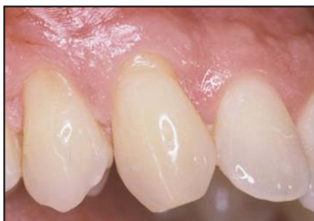
Figure 7. Case 2. Class I recession on the right canine and the first bicuspid.