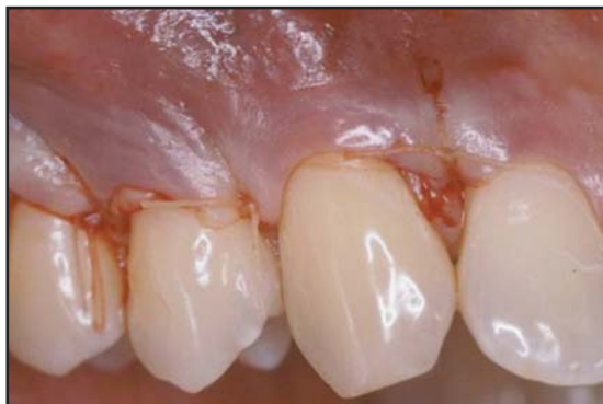
Figure 12. The membranes are placed on the left vascularized recipient bed and over the recession.