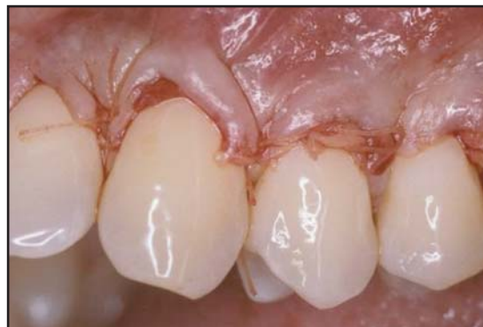
Figure 14. The left flap is advanced coronally without tension covering the PRF membranes.