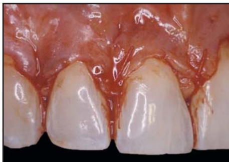
Figure 5. The flap is advanced coronally over the gel and sutured.