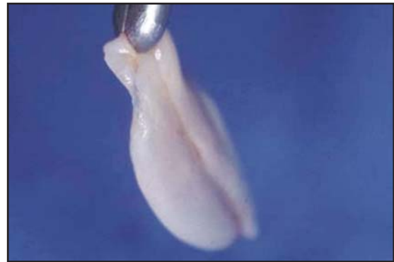
Figure 10. The PRF gel is separated from the other layers and placed on special gauze prior to compression. Clinical aspects of three overlapped PRF membranes.

Platelet-Rich Fibrin (PRF) affects cell biology activities on both the genetic and cellular levels. 15,16 The action of growth factors present in PRP is more complex (ie, they interact and regulate each other's effects). Platelet-derived growth factor (PDGF)-AA and (PDGF)-BB were both major mitogens for human periodontal ligament cells and transforming growth factor. (TGF)- \beta played a significant role as a regulator of the mitogenic responses and the immune response. 16,17