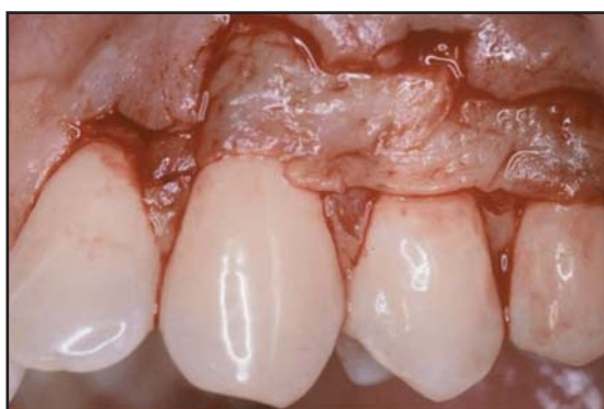
Figure 13. The right flap is advanced coronally without tension covering the PRF membranes.

full-thickness flap was then reflected beyond the mucogingival junction and at least 5 mm apical to the most apical margin of the bony dehiscence. A partial-thickness flap was further created by sharp dissection to permit flexibility in the coronal direction.